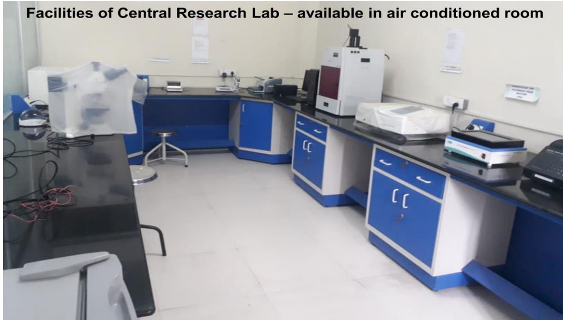
Facilities of Central Research Lab – available in air conditioned room

Ph.no: 044-27598484/27565195; Fax: 044-27565170; E-mail: kims.medical@yahoo.com ; Website: www.kveg.in